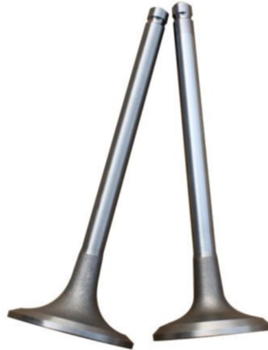
Shot Blasted Valves

Engine valves which are made up of Austenitic stainless steel except for the tip, which is made up of the Martensitic steel, are known as the 'BOTTOM WELDING VALVES'.