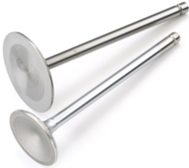
Bottom Welded Valves

Engine valves which are made up of Austenitic stainless steel except for the tip, which is made up of the Martensitic steel, are known as the 'BOTTOM WELDING VALVES'.