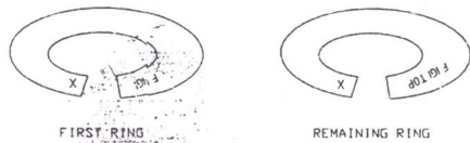
FIRST RING REMAINING RING DETAIL OF IDENTIFICATION MARK OF M/S INDO GERMAN